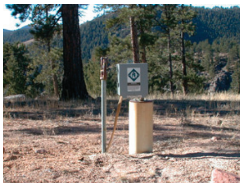
Figure 1: Rural domestic well in the foothills.

Ground water is found in formations called aquifers that occur throughout the state. An aquifer is a geologic formation made up of porous material such as sand, gravel, and unconsolidated rocks. It may also consist of spaces or fractures between subterranean rocks that are saturated with water. Aquifers may be as shallow as a few feet, or as deep as thousands of feet below the ground surface. Wells in mountainous areas of the Front Range typically average 350 feet deep; while in eastern Colorado, over the Ogallala aquifer, they average less than 300 feet deep. Ground water originates as precipitation that moves downward from the earth’s surface until it reaches the water-saturated zone and becomes ground water. Aquifers may spread hundreds of miles or may be in small, localized areas. Alluvial or tributary ground water moves through the aquifer, where it eventually joins a surface stream.