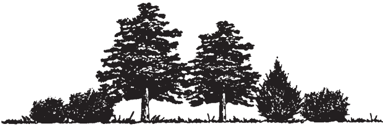
Figure 2: Ladder fuels enable fire to travel from the ground surface into shrubs and then into the tree canopy.