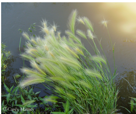
Figure 1. Foxtail barley growing alongside an irrigation ditch.

Foxtail barley ( Hordeum jubatum ) is a showy short-lived native perennial cool season bunchgrass that belongs to the grass tribe Triticeae . It has a shallow root system and reproduces by seeds and tillering. This plant ranges in height from one to three feet tall at maturity. It is often found in pastures, roadsides, meadows, alkaline/saline areas, moist soils and disturbed areas (Figures 1 and 2). In general, it is found more often where water accumulates (seasonally ponded areas, wet meadows and areas near ditches and streams). Foxtail barley is often found to be growing alongside grasses and weedy forbs adapted to wet and/or alkali/saline environments. These associated plants often include bentgrass ( Agrostis spp. ), inland saltgrass ( Distichlis spicata ), alkali sacaton ( Sporobolus airoides ), Kentucky bluegrass ( Poa pratensis ), basin wildrye ( Leymus cinereus ), tall wheatgrass ( Thinopyrum ponticum ), horsetail ( Equisetum spp. ) and Baltic rush ( Juncus balticus ).