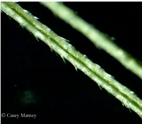
Figure 3. Foxtail barley awns at 4X magnification, displaying barbs.

containing foxtail barley should not be hayed. In addition, hay contaminated with foxtail barley should not be used or sold. There are anecdotal accounts of ranchers processing contaminated hay through a hammermill to decrease the danger of feeding foxtail seeds to animals. However, the effectiveness of this treatment has not been tested and is not recommended.