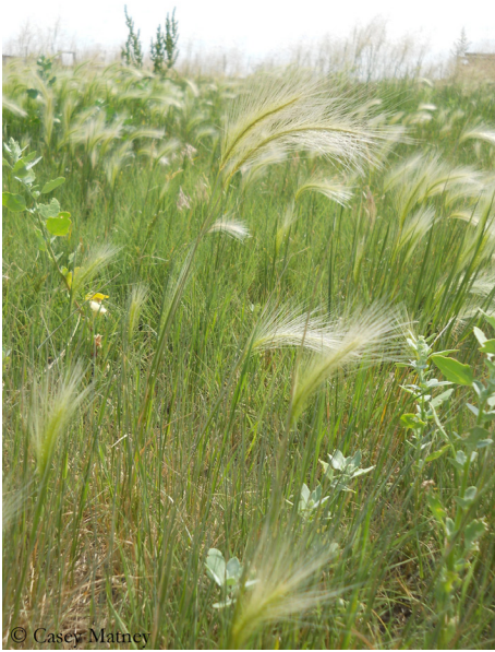
Figure 2. Foxtail barley growing in a pasture, an area often ponded during the spring.