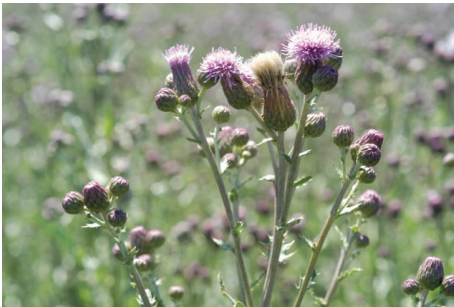
Figure 5: Canada thistle in flowering growth stage.