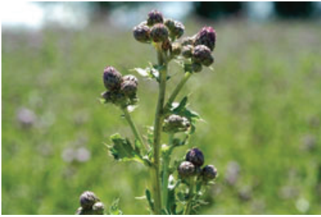
Figure 4: Canada thistle in the late bud growth stage.