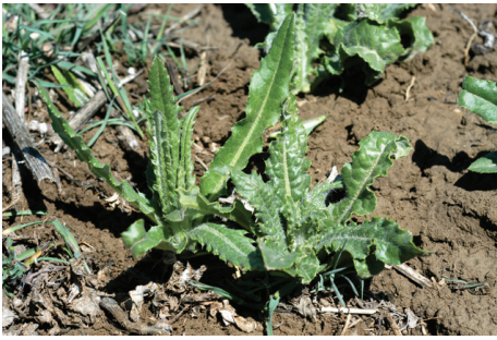
Figure 2: Emerged Canada thistle rosettes from roots in early spring.