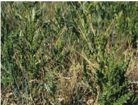
Figure 3: Canada thistle bolting growth stage in spring.

Canada thistle allocates most of its reproductive energy into vegetative propagation. New shoots and roots can form almost anywhere along the root system of established plants (Figure 6). Tillage segments roots and stimulates new plants to develop. Shoots emerge from root and shoot pieces about 15 days after disturbance by tillage. Small root pieces, 0.25 inch long by 0.125 inch in diameter, have enough stored energy to develop new plants. Also, these small roots can survive at least 100 days without nutrient replenishment from photosynthesis.