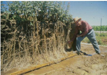
Figure 6: Canada thistle root system after 14 months growth from 25 vegetative shoot cuttings.

present after cutting to intercept herbicide following regrowth. Additionally, root nutrient stores decrease after mowing because the plant draws on them to develop new shoots.