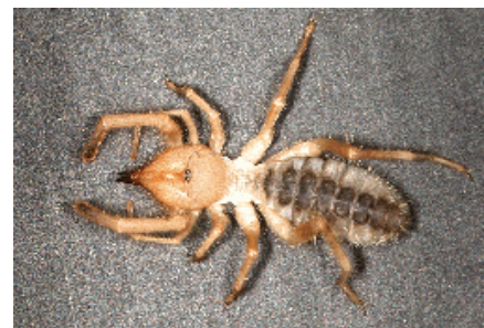
Figure 1: Sunspider.

There are approximately 15 species in the state, all in the genus Eremobates . The ones typically found in a home range from about 1/2 to 1 1/4 inches and are light brown to reddish brown.