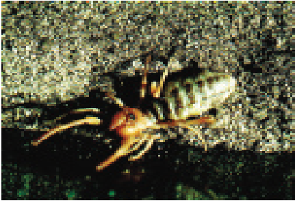
Figure 2: Sun spider, a.k.a. wind scorpion.

Several measures can be taken to limit their movement into homes. Most important, seal any cracks or openings around the foundation and reduce lighting. Capture individual sunspiders on sticky traps or herd them into a container and dispose of them.