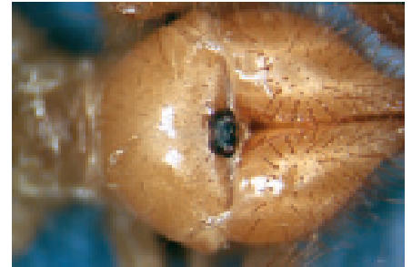
Figure 4: Head of a sun spider.