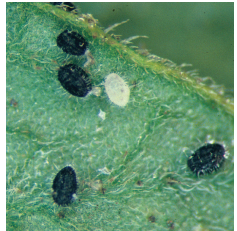
Figure 3: Greenhouse whitefly nymphs. Black forms are parasitized.