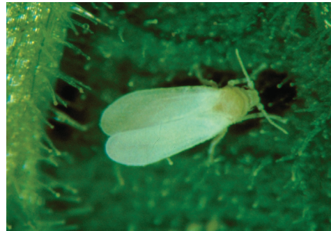
Figure 1: Adult greenhouse whitefly.

The familiar form is the white, winged adult. Because of the insect's mobility, most