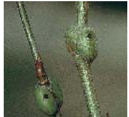
Figure 4: Poplar twiggalls showing evidence of predation by chickadees.

Insecticides applied as sprays have worked poorly to control this insect. However, soil applications of the systemic insecticide imidacloprid have provided good control in nursery settings. The insecticide should be applied as a drench to the soil over the root zone of the tree just prior to or at bud break. (If mulches are present they should be raked away prior to application to expose the soil during application.) The treated area must be watered so that it remains moist for at least two weeks to allow adequate uptake by the roots.