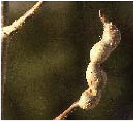
Figure 1: Galls produced by twiggall fly, with emerging pupae.