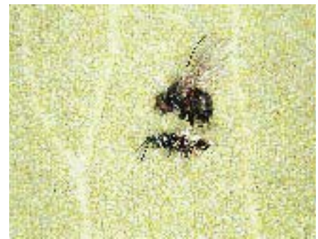
Figure 5: Poplar twiggall fly and parasitic wasp.