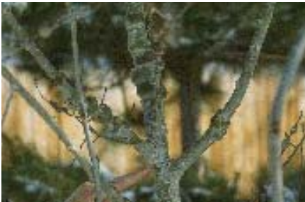
Figure 2: Continued expansion of galls on older wood.