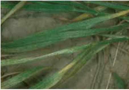
Figure 3: Wheat plant damaged by brown wheat mite. Mites can be seen on leaves.