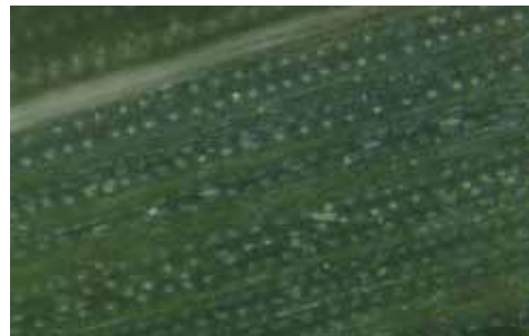
Figure 2: Wheat curl mites in veins of wheat leaf.

Field Biology. Eggs, immature stages and adult wheat curl mites (Figure 2) are found in the winter on wheat and other nearby perennial grasses. As temperatures rise in the spring, mite populations develop under leaf sheaths, inside newly emerged leaves,