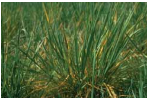
Figure 1: Wheat plant affected by wheat streak mosaic.