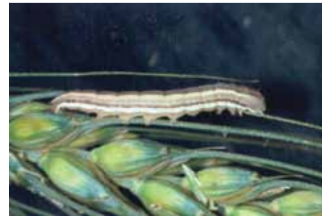
Figure 4: Wheat head armyworm (variable in color).

Scouting and Treatment. Use a sweep net to sample for wheat head armyworm.