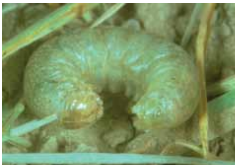
Figure 2: Pale western cutworm.

Host Plants. Small grains, corn and other crops are attacked by pale western cutworm. In Colorado, this insect is a major pest of winter grains.