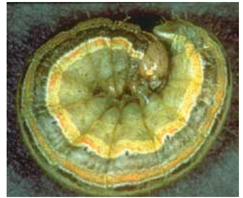
Figure 3: Armyworm.

Field Biology. The armyworm cannot survive Colorado winters. Instead, armyworm moths migrate into Colorado in early summer. They lay their eggs in rows or clusters on the lower leaves of various grass crops. They prefer dense, grassy vegetation for oviposition. Newly hatched larvae move with a looping (inchworm) action. Larvae feed at night and on cloudy days and hide under crop debris during sunny periods. One or more generations may occur per year.