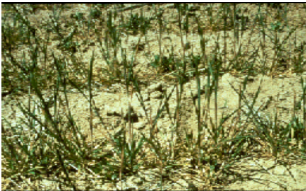
Figure 3. Wheat plants damaged by the Russian wheat aphid.