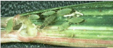
Figure 2. Discoloration caused by the Russian wheat aphid.