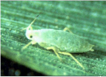
Figure 1. The Russian wheat aphid.