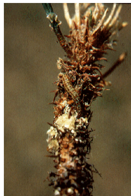
Figure 1: Ponderosa pine budworm larva in infested shoot.

The larvae continue to feed as the foliage develops, going through a succession of moults before reaching the pupal stage in late June. The feeding larvae produce a great deal of silk that