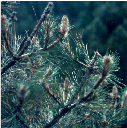
Figure 3: Pine shoots damaged by budworm feeding.

surrounds the bases of the needles on which they feed. Pupation takes place amid the damaged foliage; the pupae are somewhat protected by the silk.