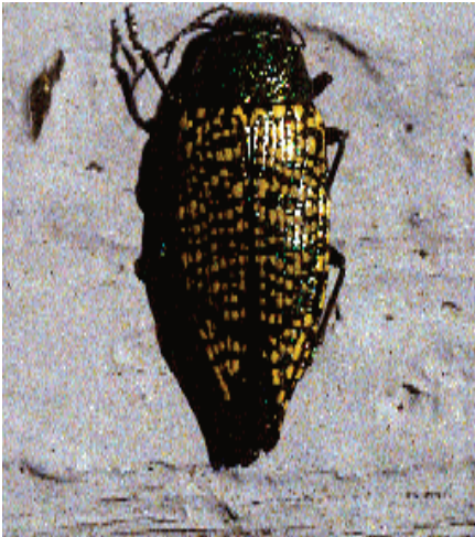
Figure 2: Metallic wood borer.

rarely tunnel extensively enough to cause structural failure. Adult borers found inside the home may look ominous and pinch the skin if handled but are not dangerous.