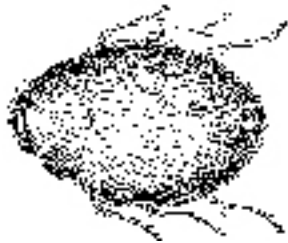
Figure 2: Stethorus lady beetle (spider mite destroyer).

Another common cause of spider mite outbreaks is insecticide applications directed against other corn pests. These kill beneficial insects and mites that, in many cases, keep the pest mite species under control. In Colorado, treatments for western bean cutworm, adult western corn rootworm, southwestern corn borer and second generation European corn borer most often are responsible for insecticide-triggered mite outbreaks. If an insecticide is necessary, monitor the treated crop for mite activity or consider including a miticide in the application.