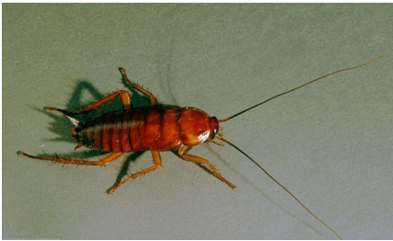
Figure 3: American cockroach.