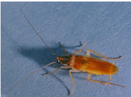
Figure 4: Brown-banded cockroach.