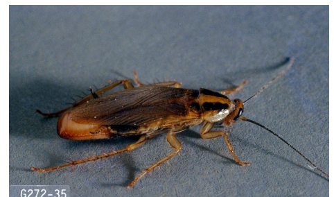
Figure 2: German cockroach.

One of the smaller species, 1/2 inch when full grown, it is light brown with a pair of parallel brown bars between the head and the front of the wings (Figure 2). This species usually is associated with buildings where food is prepared or stored. It commonly migrates from infested areas into nearby dwellings or may be carried in on food containers.