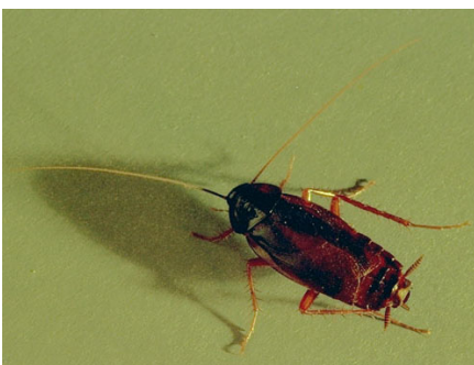
Figure 5: Oriental cockroach.

furnaces, homes, the American cockroach more commonly is found in warm, moist areas of industrial or commercial buildings. Furnace or boiler rooms, sewers and heat tunnels are favored environments.