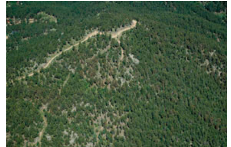
Figure 3: Aerial view of Ponderosa pine needle damage. Notice light discoloration of trees.