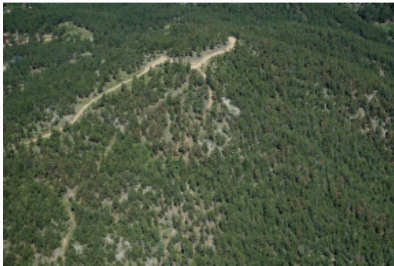
Figure 3: Aerial view of Ponderosa pine needle damage. Notice light discoloration of trees.

from within, a sure sign of needle miner activity. Other factors such as total tree death caused by bark beetles, needle diseases, or misuse of herbicides also cause needles to fade. However, only needle miners hollow out the needles.