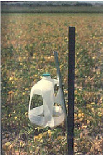
Figure 5: "Milk jug" pheromone trap.

4. Treatments are most effective if applied 10 to 20 days after peak flight. This allows time for all eggs to hatch, but is early enough to avoid damage from large larvae.