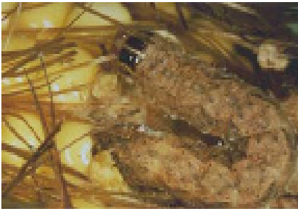
Figure 2: Western bean cutworm larva.