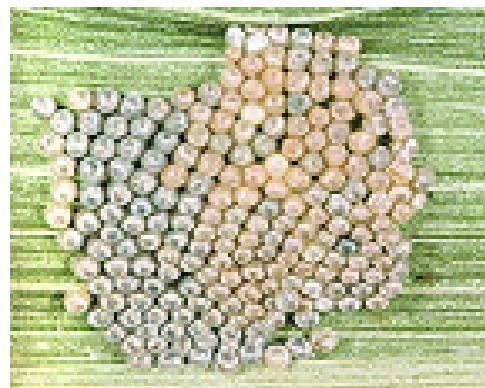
Figure 1: Western bean cutworm egg mass.

The western bean cutworm passes through five developmental stages – egg, larva, prepupa, pupa, and adult (moth). The dome-shaped eggs, which are slightly larger than the head of a common pin, are laid in flat, irregularly shaped masses (Figure 1.), usually ranging from 15 to 50 eggs per mass. When first laid, eggs are white with a thin, red ring around the top. Eggs darken with age, first to brown and then to purple or black just before hatch.