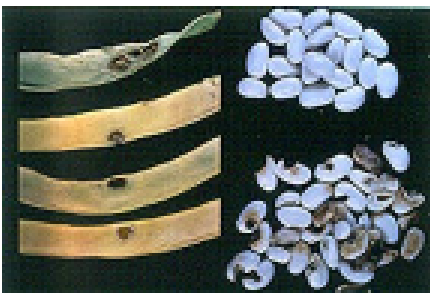
Figure 4: Western bean cutworm damaged pods (left) and seeds (lower right).

Currently labeled insecticide products are given in the High Plains Integrated Pest Management Guide available on the Web at www.highplainsipm.org .