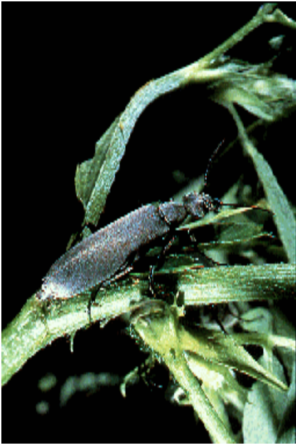
Figure 2: E. fabricii , a blister beetle common in June in Colorado.

associated with grasshopper outbreaks. Consequently, alfalfa grown near rangeland has a greater likelihood of blister beetle infestation.