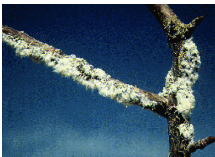
Figure 5: Woolly apple aphid on stem.

Aphids on fruit trees spend the winter as eggs clustered near the buds.