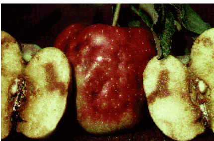
Figure 4: Apple maggot injury to apple.

Pear psylla problems are greatly lessened in unsprayed orchards, where they are heavily attacked by parasites.