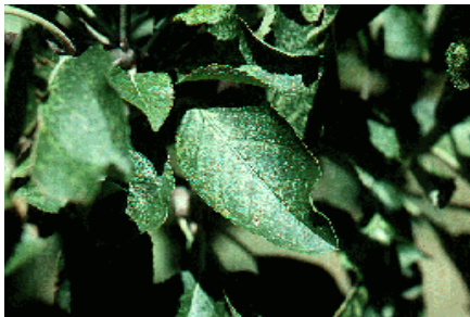
Figure 6: White apple leafhopper injury to foliage.

Russet mite, sooty mold growing on pear psylla honeydew, damage from oil-based sprays