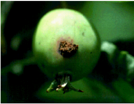
Figure 2: Frass from codling moth on apple.

Insecticides can be limited and treatments better timed by using pheromone traps. These specialized traps are baited with the sex attractant of the female codling moth. The traps capture male moths and give an estimation of when mating and egg-laying take place. The first insecticide application is often optimal about three weeks after the first consistent captures of male moths. The traps also can give some estimation of how many insects are present. It has been suggested that for backyard orchards, there is little benefit from treatment if trap captures are less than five per week. In some of the Western Slope fruit-producing counties, codling moth and other fruit insects are routinely monitored. Information on their activity is made available through codaphone messages and other media by Colorado State University Extension county offices and regional Experiment Stations.