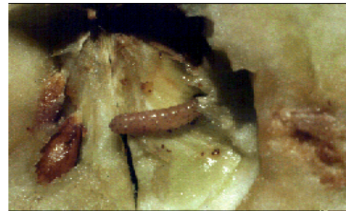
Figure 1: Codling moth larva in core.

The immature (larval) stage of the codling moth ( Cydia pomonella ) is the worm in "wormy apples." Codling moth also commonly damages pears and larger-fruited varieties of crabapples. Wherever these fruit trees are grown in Colorado, codling moth is a serious problem and usually will need some treatment to protect the fruit.