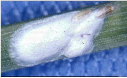
Figure 1: Pine needle scale.