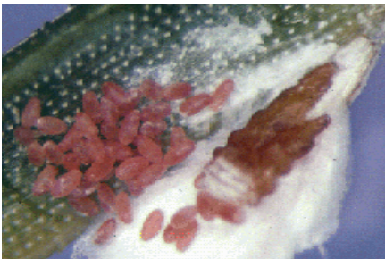
Figure 2: Pine needle scale exposed from cover while laying eggs.

late summer. Because egg hatch may be extended, a distinct second generation does not always occur. These later-emerging young primarily settle on the current season needles.