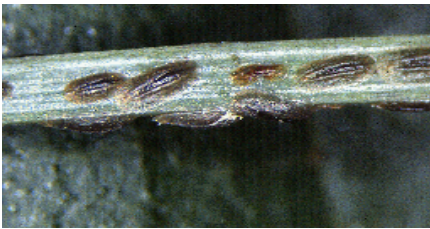
Figure 5: Pinyon-needle scale, “bean stage” nymphs on needles.

Striped pine scale nymphs are generally orange to brown. Female scales remain on the twigs while males migrate to the needles. Males become enclosed in a papery covering as they mature. They emerge to mate with the females in late summer. There is one generation per year.