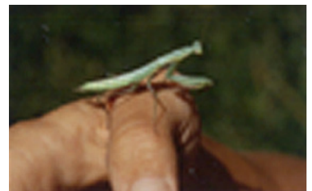
European mantid nymph.

The terms mantid and mantis are often used interchangeably. Technically, Mantis is properly applied to a genus of mantids, the most widely recognized being “the” praying mantid, Mantis religiosa . Mantid is the best term applied to members of this order, Mantodea.