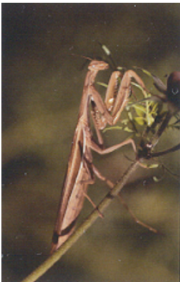
European mantid, brown form adult.