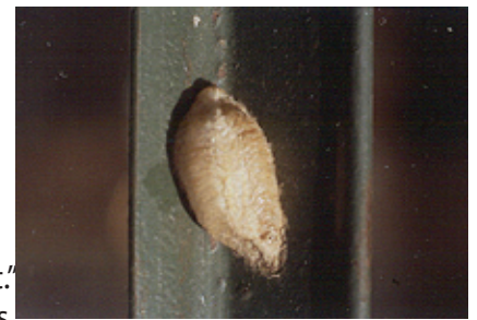
European mantid egg case.

Mantids survive winter as eggs. The eggs are laid in masses, sometimes including hundreds of eggs. These egg masses, known as oothecae are often insulated with a foamy material that gives them the appearance of a "packing peanut." They are attached to solid surfaces such as rocks, buildings, and dried plant stems.