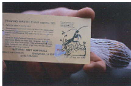
Chinese mantid egg case.

Egg cases of the Chinese mantid are commonly sold via mail order and the young can be reared easily. However, they should be kept in separate containers because of their cannibalistic habits. Small active insects, such as leafhoppers and fruit flies, are suitable to feed the younger mantids. Midges and other small flies that gather around porch lights are another good source of food for the newly emerged mantids. As they get older larger foods such as grasshoppers or crickets can be used. Mantids do need some additional water, which can be provided by misting the inner surface of the rearing container once a week.