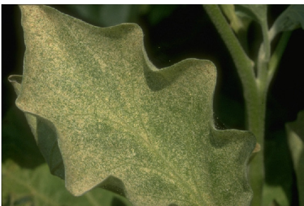
Figure 3: Twospotted spider mite injury to eggplant.

One reason that spider mites become problems in yards and gardens is the use of insecticides that destroy their natural enemies. For example, carbaryl (Sevin) devastates most spider mite natural enemies and can greatly contribute to spider mite outbreaks. Malathion can aggravate some spider mite problems, despite being advertised frequently as effective for mite control. Soil applications of the systemic insecticide imidacloprid (Merit, Marathon) have also contributed to some spider mite outbreaks.