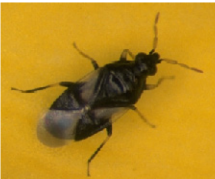
Figure 5: Minute pirate bug.