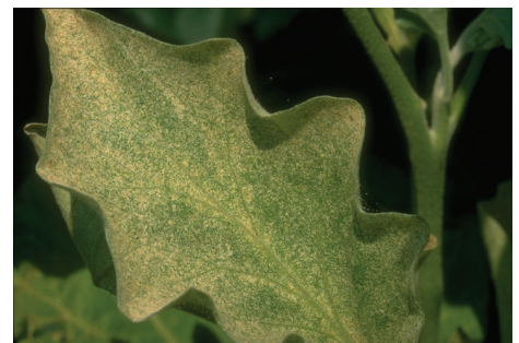
Figure 3: Twospotted spider mite injury to eggplant.

A great many mites in the family Phytoseiidae are predators of spider mites. In addition to those that occur naturally, some of these are produced in commercial insectaries for release as biological controls. Among those most commonly sold via