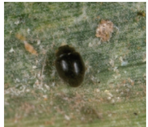
Figure 4: "Spider mite destroyer" lady beetle.