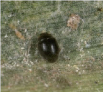
Figure 4: "Spider mite destroyer" lady beetle.