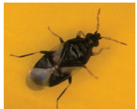
Figure 5: Minute pirate bug.