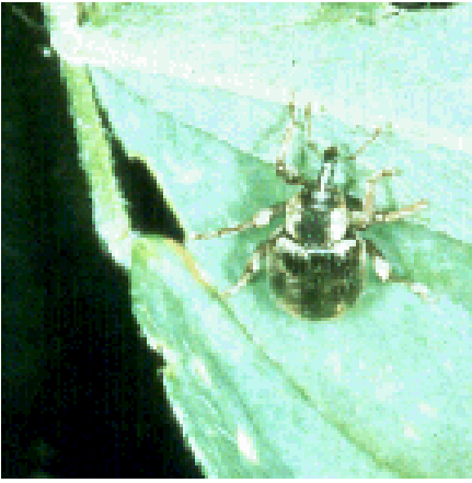
Figure 1: Adult weevil.