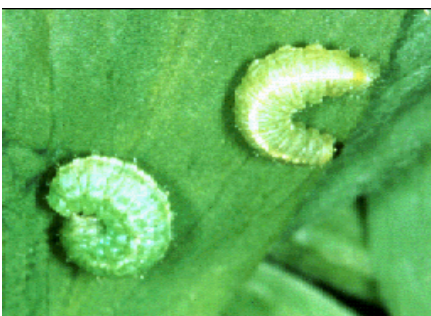
Figure 3: Mature larvae.

varieties and timing of cutting can help reduce weevil problems. Varieties rated as weevil-tolerant varieties such as Perry and Arc will still produce good yields even after a moderate amount of weevil damage.