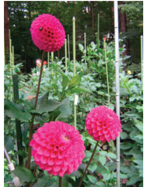
Figure 4: Three-ball form dahlias.

Tuberous begonias range in color from white, yellow and orange to deep red. Flowers are usually double and bloom for a long period. Plant the tuberous begonia roots (which may be up to 1 ½ inches in diameter) 4 inches deep in a partially-shaded area. Tuberous begonias do best in soil with high organic matter that is kept relatively moist. After frost, dig the roots from the ground, pack in sawdust, and store under cool, but frost-free conditions for replanting in the spring.