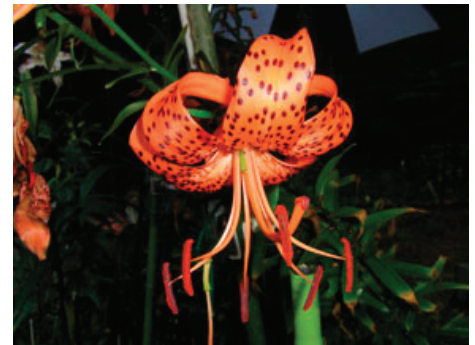
Figure 5: Tiger lily.

Allium is a member of the onion family, but these plants are very ornamental and showy. Plants vary in height, and flowers can range from two to ten inches in diameter. Dwarf species thrive in rock gardens, and taller species enhance larger gardens. Allium flowers are ball-shaped and consist of many tiny florets in hues of white, yellow and blue. These bulbs make great cut flowers that last for a long period of time; flower heads can also be left to dry on the plant and later cut for dried arrangements. While alliums do not need to be dug from the ground after frost, be sure to mulch the bulbs well to ensure winter survival.