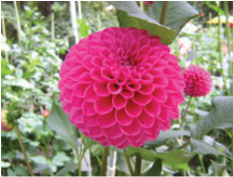
Figure 1: Ball form dahlia.

Dahlias come in a wide range of flower and plant sizes, and nearly every color, except a true blue. Dahlias usually require support because of their height. Provide support by driving a stake into the ground 12 inches deep and 6 inches behind the root at the time of planting. Dahlias do not tolerate frost, so plant the tuberous roots after all frost possibilities have passed. Dahlia flower size can be increased by removal of flower buds from lateral branches. However, this practice may reduce the overall showiness of the plant.