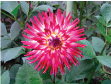
Figure 2: Pink and white dahlia.