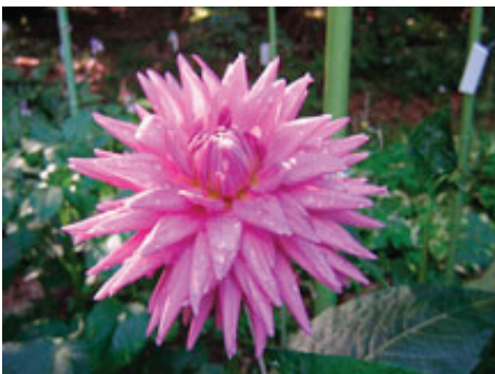
Figure 3: Pink dahlia with water drops.

After the vegetation is killed by frost, prune back the stalks to 6 inches. Leave the tuberous roots in the ground for two weeks to harden before digging them. Dig carefully so the tuberous roots do not break away from the clump. If the clump separates, there is a risk of 'blind roots', tuberous those that do not produce a shoot because there is not vegetative 'eyes'. Dry the tuberous roots enough to shake off excess soil, and pack in sawdust, perlite or vermiculite and store in a cool, dry place until spring.