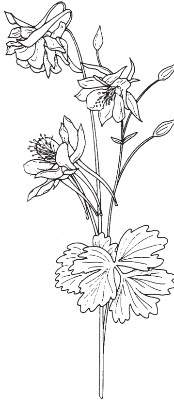
Table 1 lists perennials adapted to the broad range of growing conditions in Colorado's lower elevations. Many also do well at higher elevations, but for a more specific listing of perennials adapted to higher elevation, see fact sheet 7.406, Flowers for Mountain Communities . Fact sheet 7.400, Ground Cover Plants includes herbaceous perennial groundcovers not listed below. More information on design and maintenance of perennial gardens can be found in fact sheet 7.402, Perennial Gardening .

Plants vary in flower color, bloom time, height, foliage texture and environmental requirements. Environmental requirements include sun exposure, soil conditions and water needs. The key to a successful perennial garden is to choose plants whose requirements match your site's conditions.