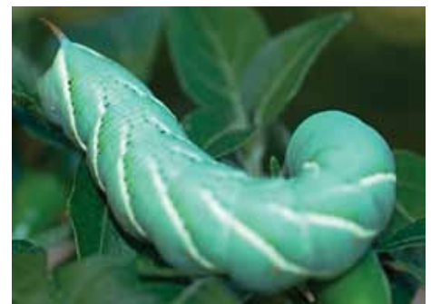
Figure 4: Tomato hornworm.

Tomato or tobacco hornworms (Figure 4) are large, green or gray-green caterpillars with white to tan v-shaped or dashed markings on their sides. A green to reddish horn protrudes from the hind end. They are voracious feeders, stripping leaves from stems and even eating unripe fruit. Pick them off by hand. The caterpillars