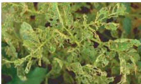
Figure 3: Evidence of flea beetles.

Flea beetles (Figure 3) are small, black or brown beetles that jump when disturbed. The adults chew small holes or