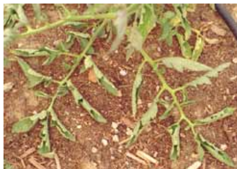
Figure 2: Psyllid damage.