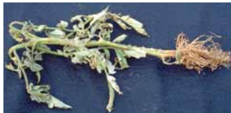
Figure 1: Phosphorus deficiency.

Psyllids (Figure 2) are more commonly found in eastern Colorado and are seldom a problem in western Colorado. They feed on tomato or potato plant sap and inject a toxic saliva that causes the characteristic "psyllid yellows." Leaves turn yellow; veins often turn purple. Stems may become distorted, giving the bush a zig-zag appearance. To confirm psyllids, check the undersides of leaves for nymphs. Nymphs are about the size of an aphid. At first, they are yellow, then they turn green. They are sedentary while feeding and secrete small, white granules that resemble sugar. For best control, dust the foliage, especially the undersides, with sulfur. See fact sheet 5.540, Potato and Tomato Psyllids .