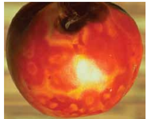
Figure 9: Tomato spotted wilt/impatiens necrotic spot.

raised lesions, often described as “bird’s eye.” This disease is difficult to distinguish from other tomato diseases and may need laboratory confirmation. If identified, destroy the plants. Do not compost plant material. Do not plant tomatoes, potatoes or eggplant in the same soil for two to three years.