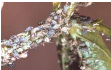
Figure 6: Aphids.

Cucumber mosaic virus and herbicide injury are almost impossible to tell apart without previous knowledge of chemicals applied or laboratory confirmation. Cucumber mosaic virus causes tomato plants to yellow and become bushy and stunted. Leaves may be mottled. The virus most often is carried in tomato seeds. Mechanical transmission by workers touching plants and movement by aphid carriers can occur, but this is much less common in tomatoes than in cucurbits. Remove and destroy plants. There are no chemical controls.