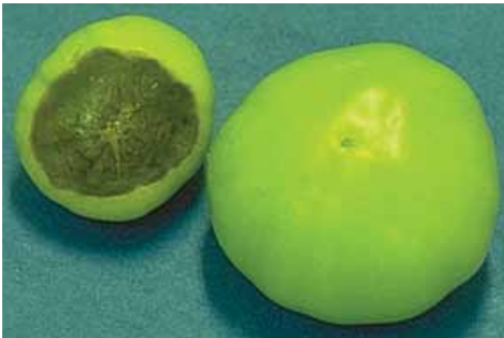
Figure 11: Blossom end rot.