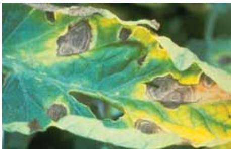
Figure 5: Symptoms of early blight.

Whiteflies and aphids (Figure 6) both cause leaf yellowing and leave a characteristic sticky excrement called honeydew. Leaves appear shiny and are somewhat sticky when honeydew is present. Damage usually is minimal on tomatoes and often can be ignored. If aphids become a problem, some applications of insecticidal soap are quite effective.