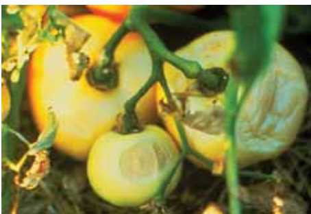
Figure 12: Sunscald on tomato fruit.

production. Recently, however, the disease has increasingly been found in home gardens. Symptoms begin as dark brown to purple spots on leaves. The dark areas spread to stems, forming cankers. Stem