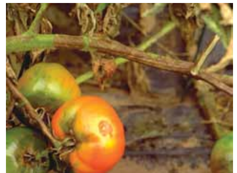
Figure 8: Bacterial canker.