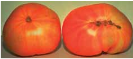
Figure 10: Catfacing.