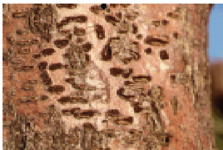
Figure 1: Thyronectria canker with dark fruiting bodies of the fungus pushing through the bark.