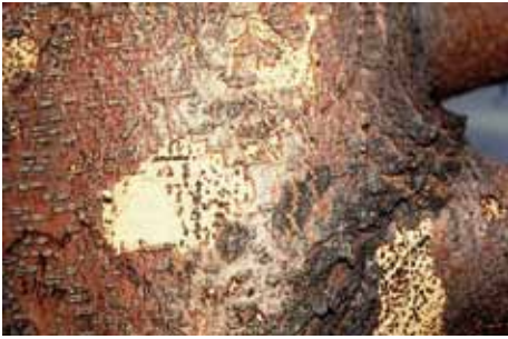
Figure 2: Tubercularia canker with small fruiting bodies of the fungus located under a thin layer of bark.