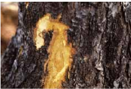
Figure 3: Collar rot symptoms – white, exposed bark and wood are healthy, while yellowish, exposed bark indicates early symptoms of collar rot.

crotches, pruning wounds or other wounds in the bark.