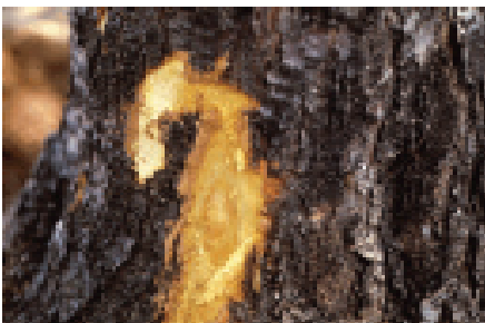
Figure 3: Collar rot symptoms — white, exposed bark and wood are healthy, while yellowish, exposed bark indicates early symptoms of collar rot.

below that point. Loose bark and discolored wood (yellow to brown instead of white) just below the bark indicate initial collar rot and are the most indicative symptoms. Extensive death and discoloration of bark and wood can occur over several months. Tubercularia or Thyronectria cankers at the tree's base usually indicate collar rot is active or was active in the past.