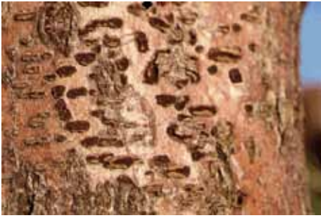
Figure 1: Thyronectria canker with dark fruiting bodies of the fungus pushing through the bark.