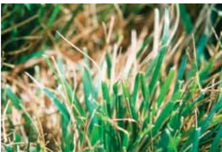
Figure 2: Ascochyta leaf blight.

Because of root loss, turf damaged by white grubs or billbugs may need to be watered daily like newly laid sod. This type of treatment may increase the severity of dollar spot and require application of an appropriate fungicide.