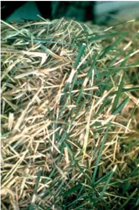
Figure 1: Dollar spot.