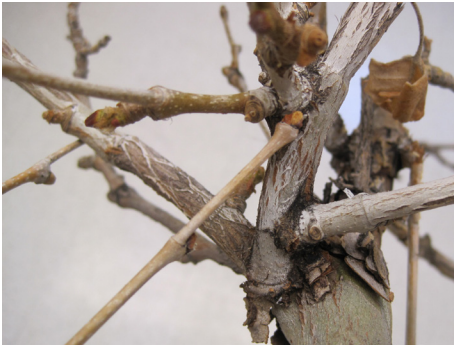
Figure 2: The 'witches broom' is where numerous shoots grow from the same point.