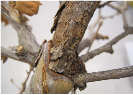
Figure 1: This sunken dead area (canker) is due to Anthracnose.