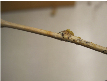
Figure 4: Note the pimple-like structures, fruiting bodies, on this stem.

local nurseries and garden centers. Always read label directions. Labels may be updated yearly or more often. If the product label does not include anthracnose on ornamentals (shade trees), use an alternative product.