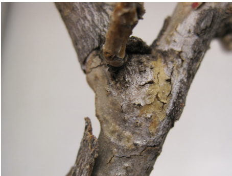
Figure 3: This canker has several fruiting bodies poking through the dead tissue.