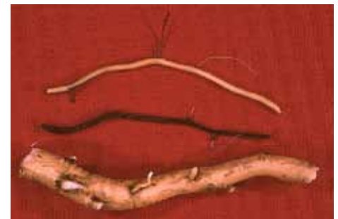
Figure 6: Top to bottom: healthy feeder root, dead feeder root, and large, perennial root.