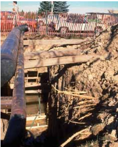
Figure 4: Trenching can severely injure a tree. Instead, auger under roots.

One of the biggest killers of urban trees is soil compaction. Soil compaction restricts water and oxygen uptake by roots, and is associated with roads, parking lots, foot traffic, construction machinery, livestock, poor soil preparation, and a host of other factors.