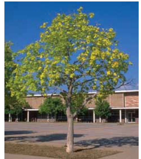
Figure 5: Yellow, chlorotic foliage from root disease.

Direct examination can verify a disease. Carefully excavate roots by removing a small patch of the bark. A brown coloration beneath the bark indicates a dead root, while a healthy root usually appears white or light-colored (Figure 6).