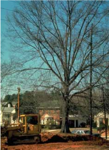
Figure 3: Root destruction, soil removal and soil compaction from construction equipment.