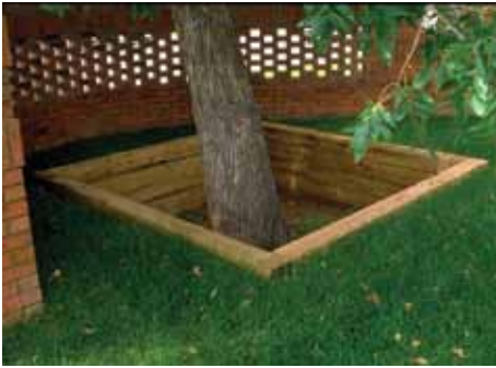
Figure 2: Tree wells cannot compensate for the addition of soil over tree roots.