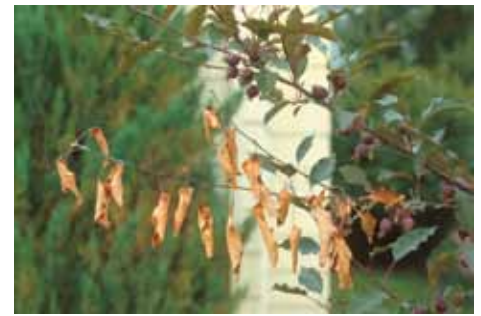
Figure 2: Blighted leaves on ornamental apple.

Cultural practices: Minimizing rapid growth and succulent tissue will reduce the risk of fire blight developing on the susceptible young, succulent tissue. Annual pruning with avoidance of major cuts will help minimize tree vigor. Similarly, limiting the amount of nitrogen fertilizer will reduce twig terminal growth. Fertilization should be based on the results of foliar and/or soil nutrient analysis and should not be applied in excess.