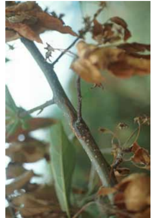
Figure 3: Sunken black canker on apple branch.

Pruning: Remove all blighted twigs and cankered branches. Prune twigs and branches 8 to 12 inches below the edge of visible infection. CAUTION! After each cut, surface sterilize all tools used in pruning. Dip tools in household bleach or ethyl alcohol, or use household spray disinfectants. Spreading the blight bacteria risk is lowered if pruning is delayed until mid winter. Winter pruning can also be accomplished more efficiently because pruning tools need not be disinfected between cuts if pruning is done when trees are fully dormant. To decrease the chance of new infections, promptly remove from the site and destroy all infected branches.