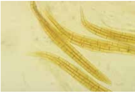
Figure 5: Ascospores of Ophiosphaerella korrae .

• Fungicide application. Several fungicides are labeled for the control of NRS (see Table 1) but their effectiveness has been inconsistent. While these products are not restricted use they, for the most part, are not are not packaged for sale at