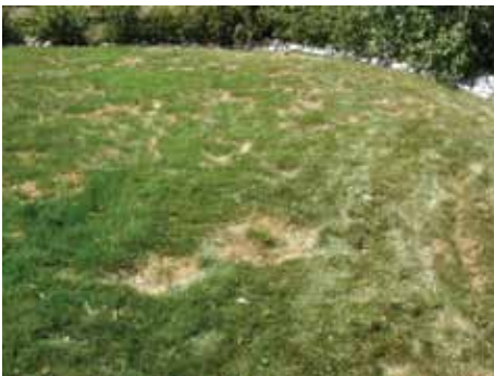
Figure 3: Advanced necrotic ringspot symptoms result in cratered rings and arcs of dead grass.

the plant. Plants with extensively damaged root systems are more prone to injury or death, particularly during periods of high temperature or drought stress. Thus, NRS symptoms often don't show up until July or August even though root colonization begins in May and continues throughout the summer.