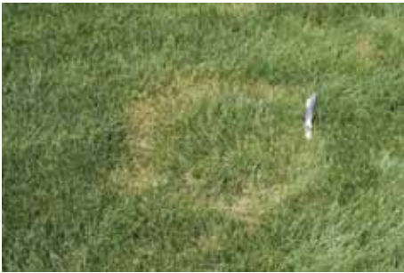
Figure 1: Necrotic ringspot symptoms may initially develop as light yellow to straw-colored rings or frog eyes in lawn.