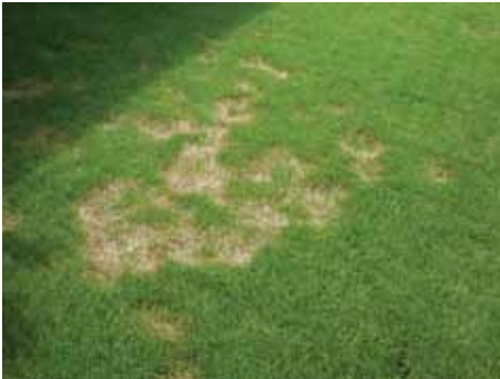
Figure 2: NRS symptoms may be localized, as shown here, or scattered throughout the lawn.