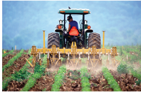
Tractors and tillage equipment must be thoroughly cleaned before being used with other crops.

Risks are not uniform for all bio-pharm applications, but will vary depending on the nature of the pharmaceutical product, the crop and tissues in which the PMP is produced, and the environment in which