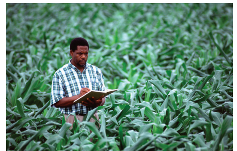
Bio-pharmed fields will be closely monitored during the growing season and in following seasons to ensure that required procedures are being followed and that volunteer plants are found and disposed of properly.

Besides the standard regulations that apply to all genetically engineered crops, bio-pharm crops are subject to additional regulatory oversight. One major difference between PMP crops and genetically engineered food crops is that the former require perpetual permitting by APHIS, whereas the latter crops, once approved by the three federal agencies, are considered "unregulated" and are freely available through commercial channels without permits. In September, 2002, FDA and USDA issued the draft document "Guidance for Industry: Drugs, Biologics, and Medical Devices Derived from Bioengineered Plants for Use in Humans and Animals", www.fda.gov/cber/