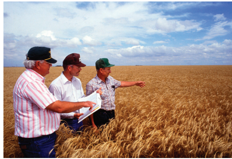
All workers involved with PMP crop production must participate annually in an APHIS-approved training program on the required procedures for growing these crops.

Many protein-based drugs are currently produced in sterile fermentation facilities by genetically engineered microorganisms or mammalian cell cultures in stainless steel tanks (Felsot, 2002). Because these fermentation plants have huge capital construction costs, industry has been unable to keep up with the growing demand. For example, the biotech company Amgen is reportedly unable to meet demand for Enbrel, a protein-based arthritis medicine made in mammalian cell cultures (Alper,