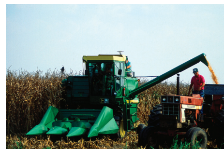
Equipment for planting and harvesting of bio-pharm crops must be dedicated to that purpose, i.e., the equipment cannot be used with any other crop.

Research on PMP crops has been ongoing for many years in laboratories, greenhouses, and field trials. In 2002, PMP crops were grown at 34 field sites totaling 130 acres in the U.S. Three PMPs currently undergoing evaluation in clinical trials are designed to target non-Hodgkins lymphoma, cystic fibrosis, and E. coli /traveler's diarrhea (Biotechnology Industry