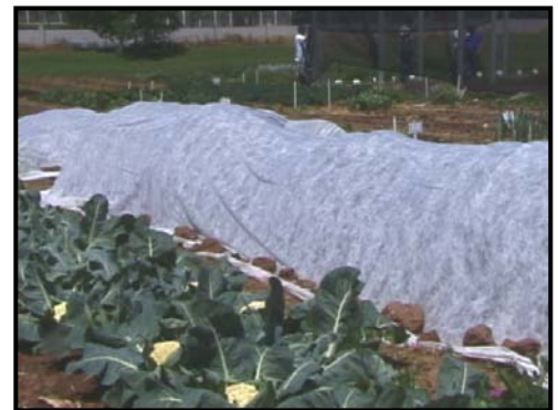
Figure 2. Floating row cover on broccoli and cabbage, protecting crops from

Floating row covers are popular in commercial vegetable production where crops planted in large blocks are easily covered with row covers. Many brands and fabric types are commercially available.