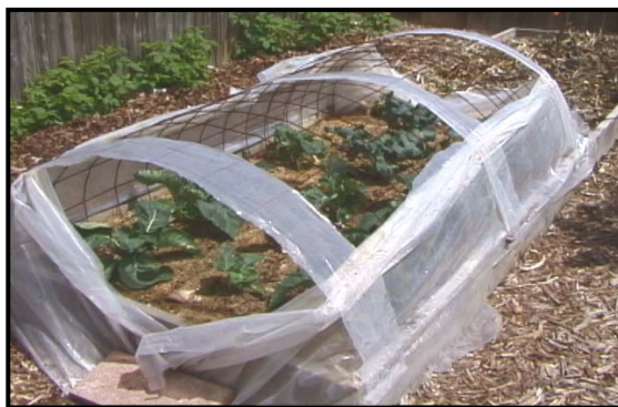
Figure 3. Cold frame for a raised-bed garden made from concrete reinforcing mesh covered with 4-mil plastic. Notice the belt-like plastic straps, which hold the covering in place. The covering is slid between the straps and mesh to open and close. Pictured open for ventilation on a warm day.

An easy cold frame structure for a growing bed is made with 4-mil clear plastic (polyethylene film) draped over concrete reinforcing mesh. The structure is easily opened during warm days and closed for cold nights. It works well with a 4-foot wide, raised-bed garden system. [Figure 3]