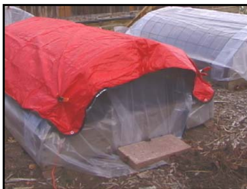
Figure 6. Aluminum space blanket covering a cold frame for extra protection on cold nights.

In trials in Fort Collins, topping a plastic-covered, concrete mesh cold frame with a space blanket prevented freezing when outside temperatures dipped to 0° F following a sunny spring day. The space blanket must be removed each day to recharge the soil's stored heat