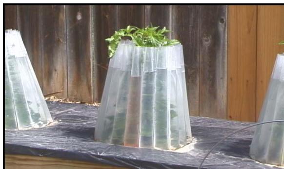
Figure 8. Tomato in Wall-of-Water. Notice use of black plastic mulch to warm the soil, another limiting factor of early production. Also, note the plant has grown beyond the device and is now less protected from frost.

Both cold air temperatures and cold soil temperatures are limiting factors in early crop production. When using a Wall-of-Water to start early crops, warm the soil with black plastic mulch. For details on using plastic mulch, refer to CMG GardenNotes #715, Mulches for the Vegetable Garden . In filling the Wall-of-Water, be careful not to splash excessive water onto the soil. A wet soil will be both slow to warm and dry in the spring. Moderately moist soils are best.