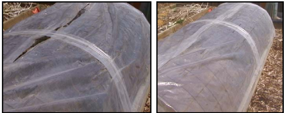
Figure 5. Left: Cover must be opened at least a slit to prevent overheating. Right: Cold frame pictured closed for a cold night.

During the day, the covering MUST be opened, at least a slit, to prevent overheating. With just an hour of sun, temperatures under a closed cover can quickly rise to over 130°! [Figure 5]