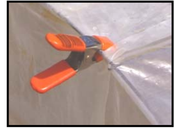
Figure 4. Clip holds plastic on frame.

Hold the plastic onto the frame with small clips available at local hardware stores. Clothes-pins do not hold in the wind. Another method is to use a series of 6-inch wide, belt-like plastic straps arching over the frame (above the plastic cover) and stapled onto the box. Open and close the cover by sliding it between the frame and the belt-like straps. Hold the plastic closed at the ends with a rock or brick. [Figure 4]