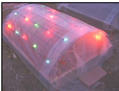
Figure 7. Cold frame with Christmas tree light for additional warmth.

Christmas tree lights – For additional protection, add Christmas tree lights inside the cold frame. In Fort Collins trials, one 25 light string of C-7 (mid-size) Christmas lights per frame unit (four feet wide by five feet long) gave 6° F to over 18° F frost protection. Lights were hung on the frame under the plastic and turned on at dusk and off at dawn. Christmas lights work better than a single, large light bulb in the center by eliminating cold corners and edges. [Figure 7]