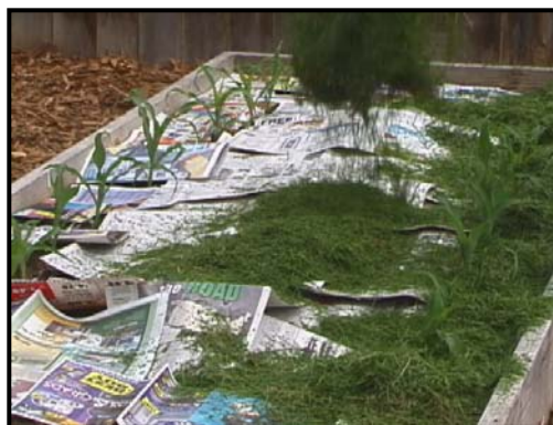
Figure 2. Corn bed being mulched with newspapers (only a couple of sheets thick) covered with grass clippings.

A couple of sheets of newspaper may be used under the clippings to help control weeds. The newspapers blow away with a light wind. It must be covered immediately with grass to hold it in place. It shuts out the light preventing seed germination. Do not apply newspapers more than a couple of sheets thick or a soil carbon to nitrogen imbalance may occur. Do not use glossy print materials; their inks may not be soy-based like newspapers. The grass and newspaper mulch may be cultivated into the soil in the fall adding small amounts of organic matter. [Figure 2]