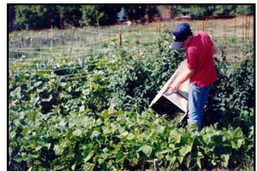
Figure 1. Grass clippings being applied to garden directly from lawn mower bag. Apply only in thin layers, allowing the grass layers to dry between applications.

Grass clippings make excellent mulch for the vegetable garden. Apply fresh clippings in thin layers (up to 1/4 inch thick) and allow each layer to dry before adding more. The clippings quickly dry down and additional layers can be added weekly. A few layers will stop weed seed germination. Do not place fresh clippings in thick piles, as they will mat, reducing water and air infiltration, stink, and may become hydrophobic. Do not use clippings from lawns that have been treated with herbicides or other pesticides in the past month. [Figure 1]