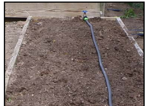
Figure 4. 30" wide tomato box being prepared for planting with soaker hose. A single row of trellised tomatoes will be planted