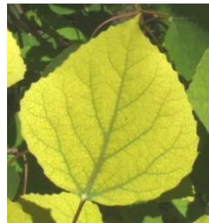
Figure 1. Iron chlorosis (yellowing of younger leaves with veins remaining green) on aspen.

If the soil has free lime , iron chlorosis is a common problem for some species of trees in heavily irrigated lawns. Avoid planting species susceptible to iron chlorosis (like silver maple and aspen) in this situation. For additional information, refer to CMG GardenNotes #223, Iron Chlorosis. [Figure 1]