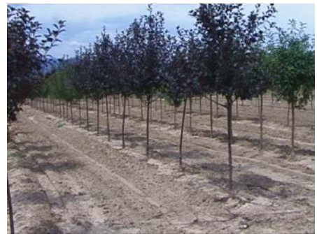
Figure 2. Field-grown B&B nursery stock

Field-grown, Balled and burlapped (B&B) trees are dug from the growing field with the root ball and soil intact. In the harvest process, only 5-20% of the small roots are retained in the root ball, the other 80-95% is left behind in the field. This puts trees under water stress until roots can reestablish. [Figure 2]