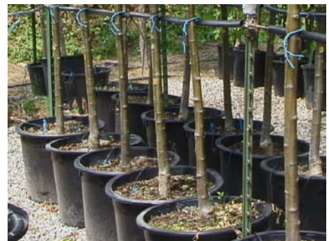
Figure 3. Container-grown nursery stock.

Container-grown nursery stock is grown in the container. Because the root system is not seriously disturbed, container-grown nursery stock can be readily transplanted throughout the growing season; spring, summer or fall.