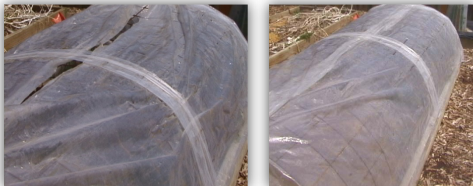
Figure 5. Left: Cover must be opened at least a slit to prevent over-heating. Right: Cold frame pictured closed for a cold night.

On cool days, open the top a crack to prevent excessive heat build-up. On a warm day, the plastic can be slid down the side, ventilating and providing crops exposure to the outdoors. On freezing nights, close the cover completely. On warm nights, the covers may be left open a crack. On stormy days with full cloud cover and no direct sun, the cover may remain closed. [Figure 5]