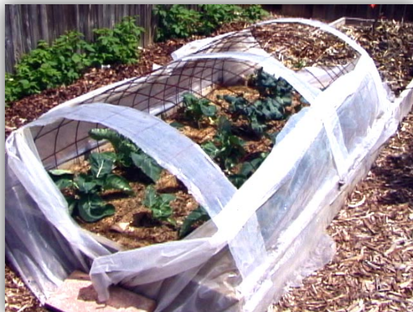
Figure 3. Cold frame for a raised bed garden made from concrete reinforcing mesh covered with 4-mil plastic. Notice the belt-like plastic straps, which hold the covering in place. The covering is slid between the straps and mesh to open and close. Pictured open for ventilation on a warm day.

The frame is concrete reinforcing mesh, available at hardware and lumber stores. This stiff wire mesh typically comes five feet wide, in 50 and 100-foot rolls. A six-foot length is required to make a Quonset-type frame over a four-foot wide growing bed. In trials, the low and spreading shape was ideal for trapping heat from the soil during a frosty night.