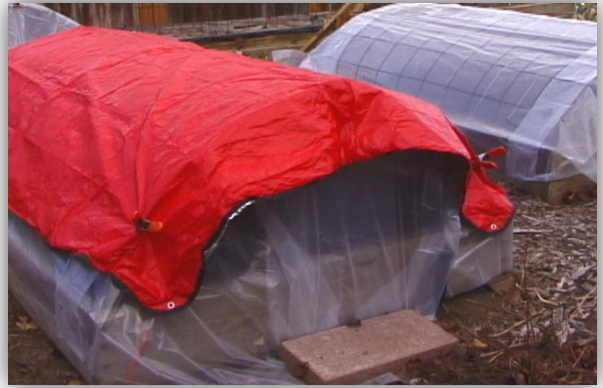
Figure 6. Aluminum space blanket covering a cold frame for extra protection on cold nights.