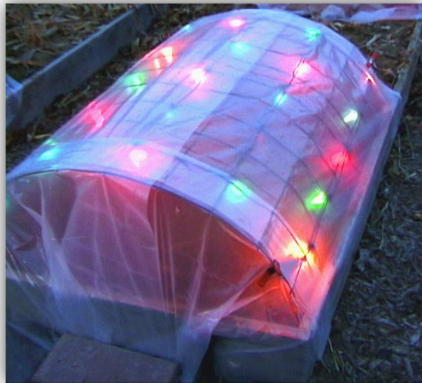
Figure 7. Cold frame with Christmas tree lights for additional warmth.

Space blanket with Christmas tree lights – For the gardener really wanting to extend the growing season, try Christmas lights plus a space blanket. One 25 light string of C-7 (mid-size) Christmas lights per frame unit (four feet wide by five feet long) with a space blanket on top gave 18°F to over 30°F frost protection in Fort Collins trials.