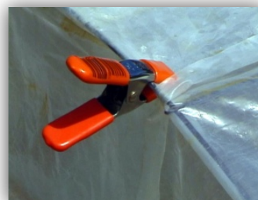
Figure 4. Clip holds plastic on frame.

Hold the plastic onto the frame with small clips available at local hardware stores. Clothespins do not hold in the wind. Another method is to use a series of 6-inch wide, belt-like plastic straps arching over the frame (above the plastic cover) and stapled onto the box. Open and close the cover by sliding it between the frame and the belt-like straps. Hold the plastic closed at the ends with a rock or brick. [Figure 4]