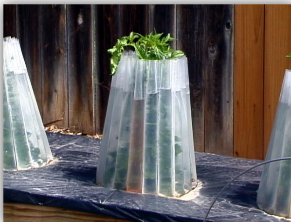
Figure 8. Tomato in Wall-of-Water. Notice use of black plastic mulch to warm the soil, another limiting factor of early production. Also, note the plant has grown beyond the device and is now less protected from frost.

Authors: David Whiting (CSU Extension, retired), with Carol O'Meara (CSU Extension, Boulder County), and Carl Wilson (CSU Extension, retired).