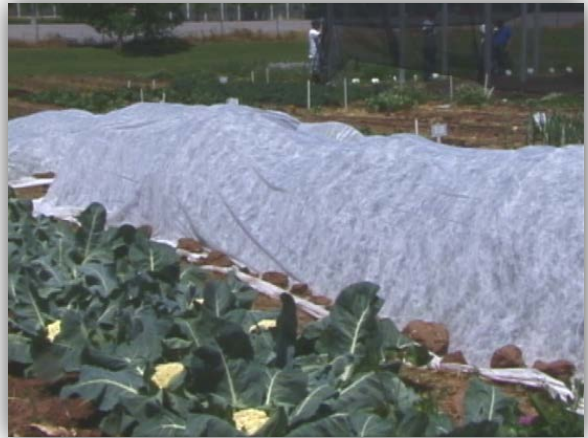
Figure 2. Floating row cover on broccoli and cabbage, protecting crops from cabbageworms moths.

Floating row covers are popular in commercial vegetable production where crops planted in large blocks are easily covered with row covers. Many brands and fabric types are commercially available.