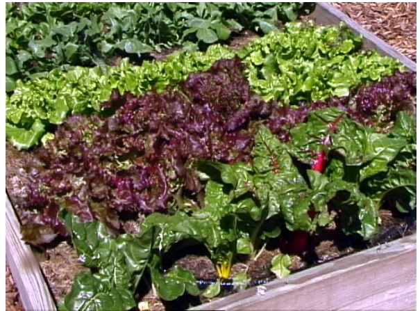
Figure 4. For a quality product, leafy vegetables need a constant supply of water, rich soils. For best quality, thin plants when crop is tiny. Here a variety of leafy vegetables are growing in a raised bed. As one row is harvested, immediately replant for a continual harvest of young tasty produce.