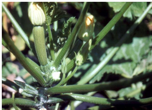
Figure 10. Vine crops have female flowers (left blossom) and male flowers (right blossoms). The female blossom has a tiny fruit at the base of the petals. For production, bees or the gardener must move the pollen from the male flower to the female flower.

Additional Information – CMG GardenNotes on vegetable gardening: