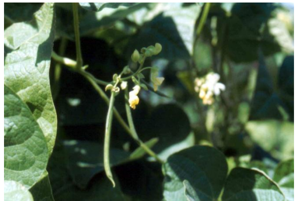
Figure 1. Beans have a high water use. With inadequate water, blossoms drop, reducing yields. When beans need water, plant color changes slightly from a dark grass green to a grayish green. Windy weather significantly increases the water demand.

Depending on temperature and wind, water use during fruiting will be ¼-inch to over ½-inch of water per day. Frequent watering in the right amount is essential for bean production.