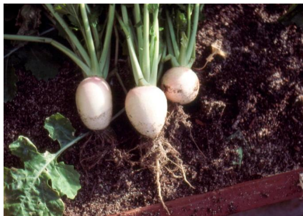
Figure 8. Burpee white radish: for quality, root crops need an even moisture supply and rich soil.