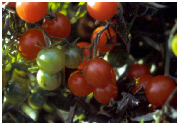
Figure 9. Sweet 100 Tomato - Over 2,000 cultivars allow the gardener lots of options in flavor, fruit size, and disease management.

Blossom end rot – Irregular watering and overwatering causes development of a dark, leathery area on the blossom end of fruits. Water consistently in a deep, improved garden soil and mulch will help prevent this condition.