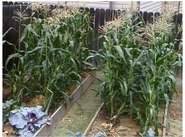
Figure 3. Corn needs to be planted in blocks for wind pollination. In this photo, two side-by-side four-foot wide beds are used. Each bed has two rows running the length of the bed, making the block four rows wide. To extend the harvest season, the top of the bed could have an early planting with a later planting at the bottom.