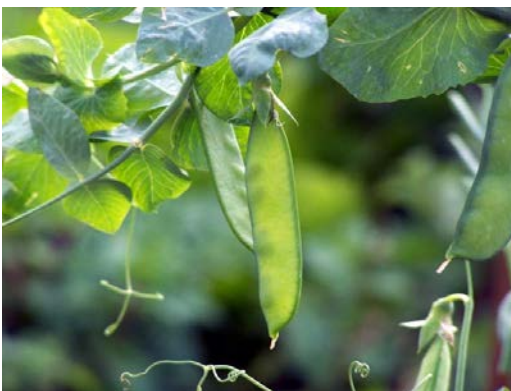
Figure 6. Snap peas are edible pod types eaten with plump peas filling the pod. Edible pod peas , sugar peas or snow peas are edible pod types eaten before the pod fills with peas.

Planting for fall harvest – Peas may be planted in mid-summer for harvest during cooler fall weather. Sweeter peas develop in cooler temperatures. However, yields of the fall crop are reduced due to photoperiodism and the vines are prone to powdery mildew in the fall.