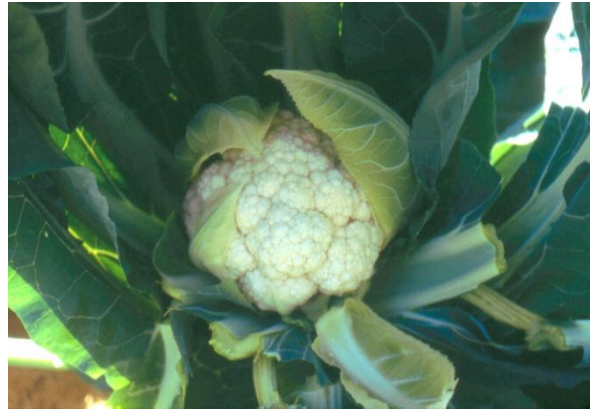
Figure 2. For optimum quality, broccoli, cabbage, and cauliflower need cool temperatures. In warm summer climates (like the Colorado Front Range) plant mid July for harvest in the cooler temperatures of fall. They will tolerate fall frost down to the mid-20s.