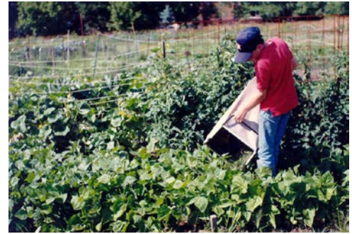
Figure 1. Grass clippings being applied to garden directly from lawn mower bag. Apply only in thin layers, allowing the grass layers to dry between applications.

Carefully hand place the grass at the base of lettuce and other leafy vegetables. Grass sticks to wet lettuce, creating a problem in food preparation.