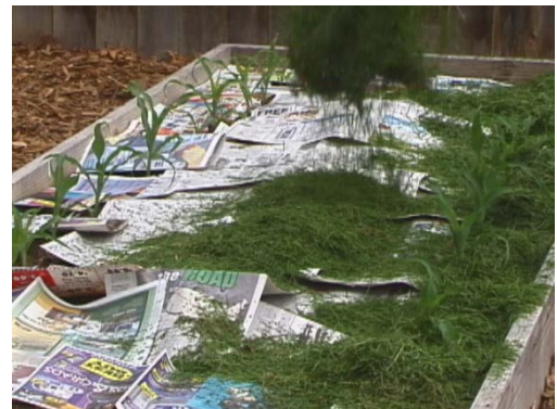
Figure 2. Corn bed being mulched with newspapers (only a couple of sheets thick) covered with grass clippings.

A couple of sheets of newspaper may be used under the clippings to help control weeds. The papers shut out light, preventing seed germination. Newspapers will blow away with a light wind, so they must be covered immediately with grass to hold them in place. Do not apply newspapers more than a couple of sheets thick or a soil carbon to nitrogen imbalance may occur. Do not use glossy print materials; their inks may not be soy-based like newspapers. Grass and newspaper mulch may be cultivated into the soil in the fall adding small amounts of organic matter. [Figure 2]