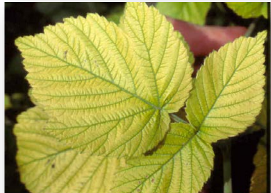
Figure 1. Symptoms of iron chlorosis include yellowing of the leaf with veins remaining green.

Iron chlorosis refers to a yellowing caused by an iron deficiency in the leaf tissues. The primary symptoms of iron deficiency include interveinal chlorosis , i.e., a general yellowing of leaves with veins remaining green . In severe cases, leaves may become pale yellow or whitish, but veins retain a greenish cast. Angular shaped brown spots may develop between veins and leaf margins may scorch (brown along the edge). [Figure 1]