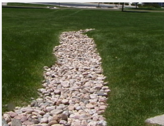
Figure 1. A French drain is a ditch-like trench filled with rock. Water must flow downhill to an outlet.

In some situations, a French drain facilitates water drainage. A French drain is a lined ditch-like trench that is filled with rock or gravel, typically with a pipe in the bottom. It catches water runoff and directs it away from structures that can be damaged. The rock should meet grade to prevent soil from covering the drain. The trench must slope at least 1-3% and flow to an outlet. [Figure 1]