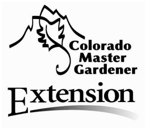
Figure 3: (Left) Use the graphic with thicker letters when you need to embroider on shirts or hats, go to www.ext.colostate.edu/Logos/MGlogos/embroidered.logo.eps