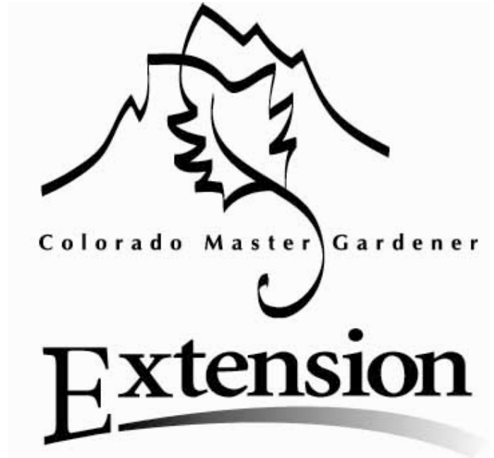
Figure 1. Standard Master Gardener mark for most use

The new Extension Colorado Master Gardener graphic (right) is the official graphic for the Colorado State University Extension Colorado Master Gardener Program. Whenever the graphic is used, the official Colorado State University logo must appear on the same page (the front page) and the two should be the primary identifiers of any piece.