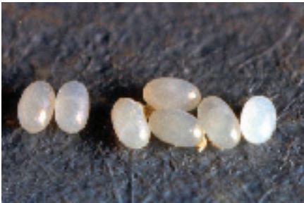
Figure 3. Cat flea ( Ctenocephalides felis ) eggs.