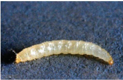
Figure 4. Cat flea ( Ctenocephalides felis ) larva.

most bites occur when the fleas are starved from the absence of favored animal hosts. Clusters of small dark spots on bedding, the excrement produced by fleas, is one clue that fleas are present.