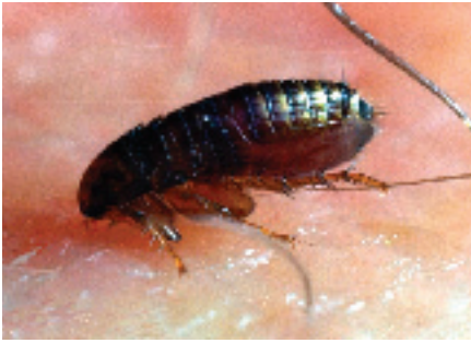
Figure 2. Cat flea ( Ctenocephalides felis ) adult feeding.