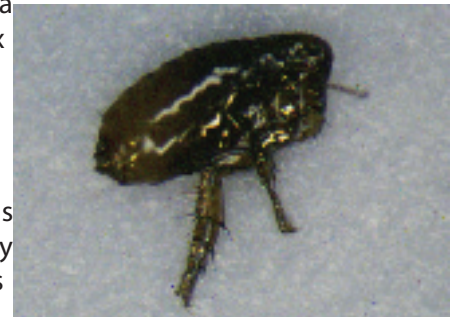
Figure 1. The human flea, Pulex irritans , a species commonly associated with denning fox.

Other fleas that occasionally bite humans are associated with squirrels, ground squirrels, prairie dogs and other wild rodents. Of these, the rock squirrel flea, Diamanus (Oropsylla) montanus , is the primary species which transmits the bacteria that produces plague.