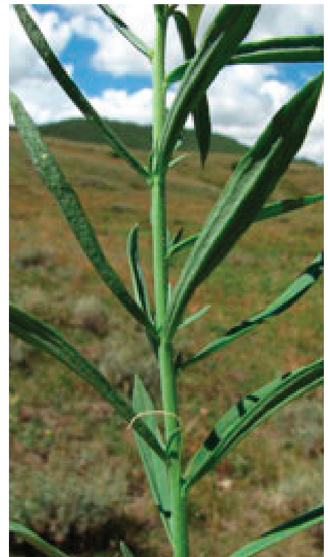
Figure 5: Yellow toadflax shoots and leaves; note narrow, linear leaf shape.