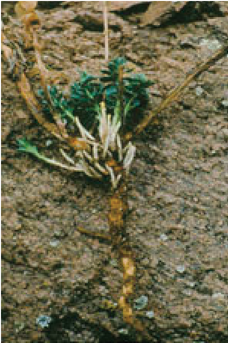
Figure 2: Mature Dalmatian toadflax shoot emergence in early spring; note well-developed deep taproot and lateral roots that were broken off during excavation.