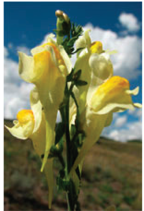
Figure 10: Yellow toadflax flowers.