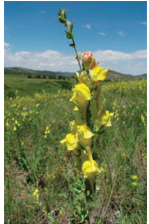
Figure 9: Dalmatian toadflax flowers.

A stem-boring weevil ( Mecinus janthinus ) and a root-boring moth ( Eteobalea intermediella ) also were released in Canada and the U.S. to control all species of toadflax. These species may help to control shoots and seed production as well as decrease root vigor, but data are unavailable to document their effects. Several of these classical biocontrol agents are available from the Colorado Department of Agriculture Insectary in Palisade. Very few published studies are available to determine whether grazing by livestock will effect any control of Dalmatian or yellow toadflax.