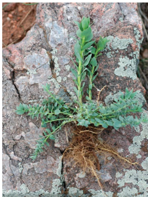
Figure 1: A second year Dalmatian toadflax plant; note prostrate shoots that survived the winter and new shoots that emerged from roots.

Yellow toadflax is native to south-central Eurasia where it was used for fabric dyes and for medicinal purposes. It was imported into North America in the late 1600s as an ornamental and for folk remedies. It was