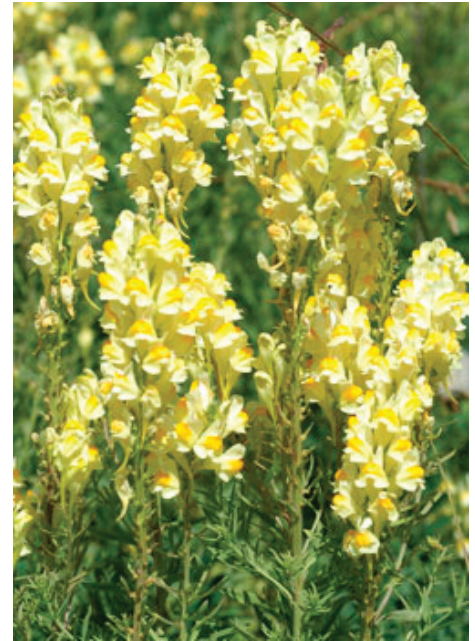
Figure 4: Mature yellow toadflax.

Dalmatian toadflax typically flowers beginning in late May or June in Colorado and may continue until fall, particularly if moisture is not limiting. Yellow toadflax begins to flower when shoots are from 16 to 24 inches tall, mid- to late May along the Front Range in Colorado, although at higher elevations (9,000 feet or more), flowering may not begin until late July. Yellow toadflax may not flower until fall under drought conditions. Flowers of both species are indeterminate, grow at the bases of upper leaves, are bright yellow with orange centers (not always in Dalmatian toadflax), and have a spur that is about as long as the rest of the flower (Figures 9 and 10). Yellow toadflax shoot phenology in any given patch may range from vegetative to flowering to seed set, depending on the time of season and environmental conditions (particularly moisture). This contributes to management difficulties.