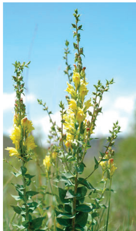
Figure 6: Mature Dalmatian toadflax.

Yellow toadflax appears to be more difficult to manage than Dalmatian toadflax. In Colorado, control from Tordon 22K applied at flowering has been most consistent and typically, 4 pt/A is recommended. Yellow toadflax usually recovers from a single application. For example, Tordon applied at 4 or 8 pt/A controlled 13 percent and 69 percent of yellow toadflax three years after treatments were applied. Other research conducted in Colorado suggests that yellow toadflax control may be improved if Tordon is applied over three consecutive years, but control varied with location. In one experiment conducted at high elevation