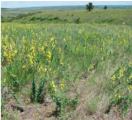
Figure 8: Dalmatian toadflax often dominates rangeland after invasion.

applied alone at 2 or 4 pt/A controlled 53 percent and 70 percent of yellow toadflax, respectively, about one year after treatments were applied; however, when these rates were mixed with Overdrive at 6 oz product/A control improved to 97 percent and 94 percent, respectively. This experiment is being repeated to determine if improved control is consistent.